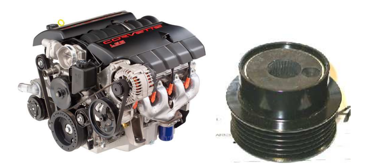
Goodyear part number 49908

Note: A special tool (802592) is available through Goodyear and must also be purchased to install the 49908.